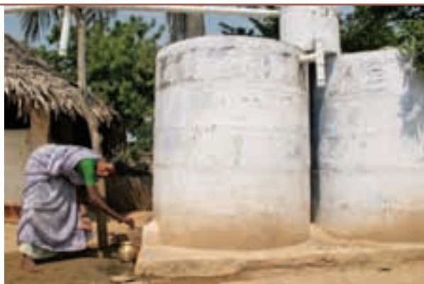
Access to safe drinking water has increased

Income has increased and income sources are diversifying, particularly for socially-excluded groups. The Andhra Pradesh Rural Livelihoods Programme has moved an estimated 1 million people above the poverty line and incomes of the poorest and of women headed households have risen by 85% and 92% respectively over the project period (as against 56% and 37% for non-beneficiaries). Across the Andhra Pradesh and Orissa programmes, food availability has improved during the traditionally "hungry months". Households report fewer days without sufficient food, increased production of staple food crops, or increased access to food through food-for-work schemes.